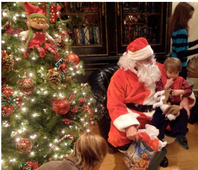
Santa Claus was busy delivering gifts to 12 children