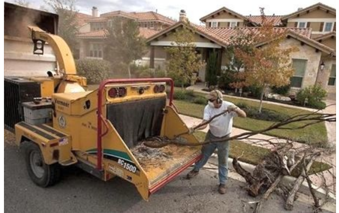
A Travis County worker removing flammable debris from Steiner Ranch.

A group of volunteers, including 40 residents and 15 students from Vandegriff High School, worked in the cleanup along with